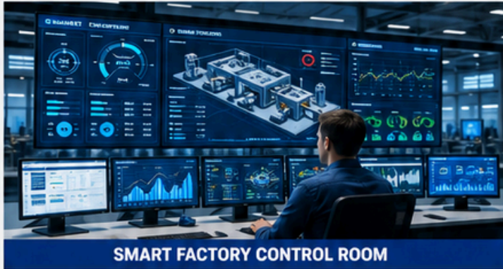
SMART FACTORY CONTROL ROOM