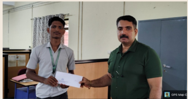
BINTO P B (S4RA)