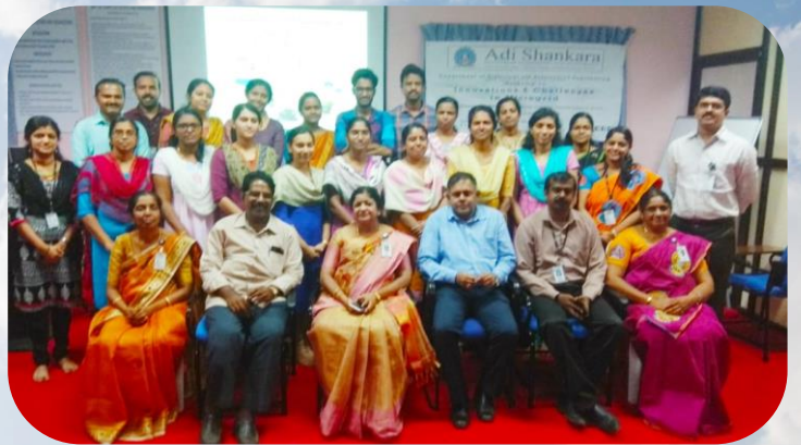
& Bhoomithra Sena of the college.